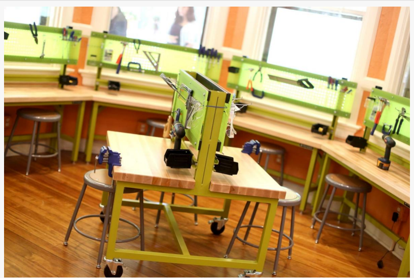
Makerspace by Formaspace

As the PC revolution took off into the 1980s, software development stepped into the spotlight. Do-it-yourselfers and entrepreneurs created thousands if not millions of different kinds of programs for personal computers.