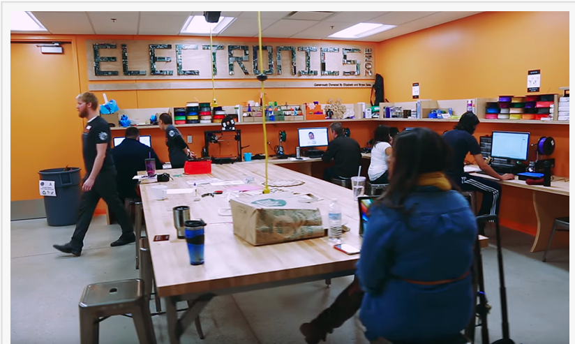
Makerspace built by Formaspace for Arizona Science Center