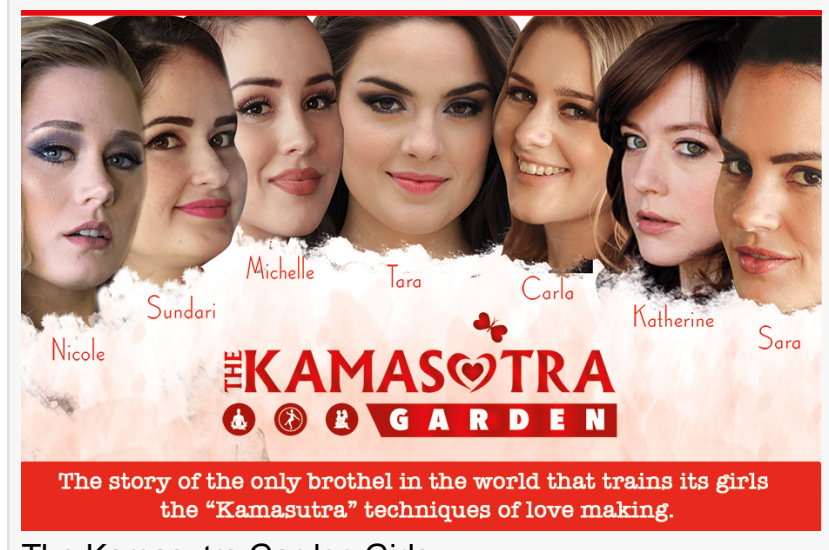
The Kamasutra Garden Girls

"The Kamasutra Garden" Synopsis: A successful business man, "Steve Banks," an exotic madam, "Sheila," and a scandalous sex guru, "Swami Kamalesh" team up to start an elite brothel called "The Kamasutra Garden" in Nevada. It is the only brothel in the world where the