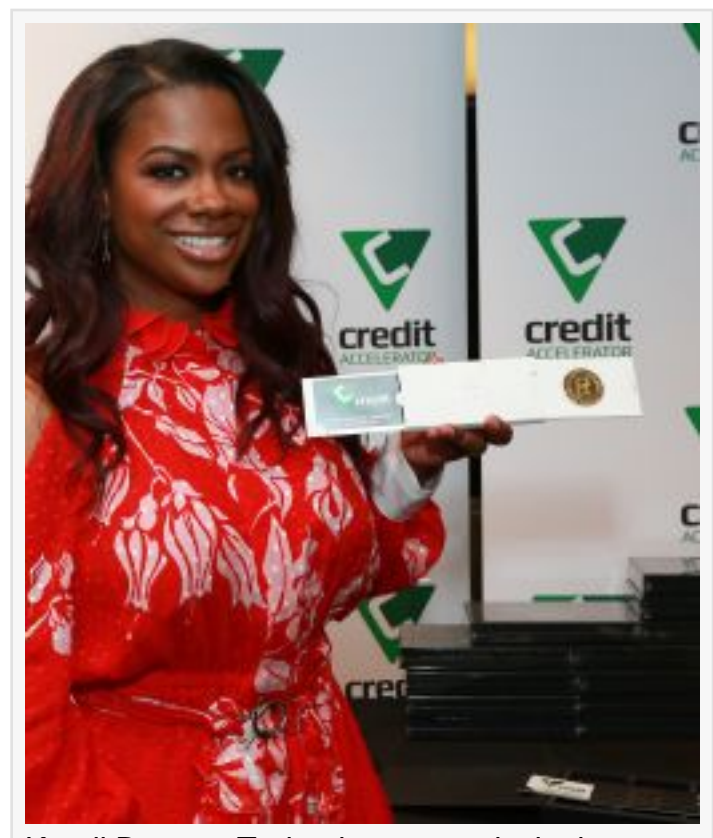
Kandi Burruss-Tucker is an award-winning American singer-songwriter, television personality, actress, record producer and business woman who knows the importance of maintaining good credit.

When it comes to improving credit, no one does it better than Credit Accelerator. You might wonder if it's credit repair, fixing or building. The answer is that it just works. Accelerating your credit is