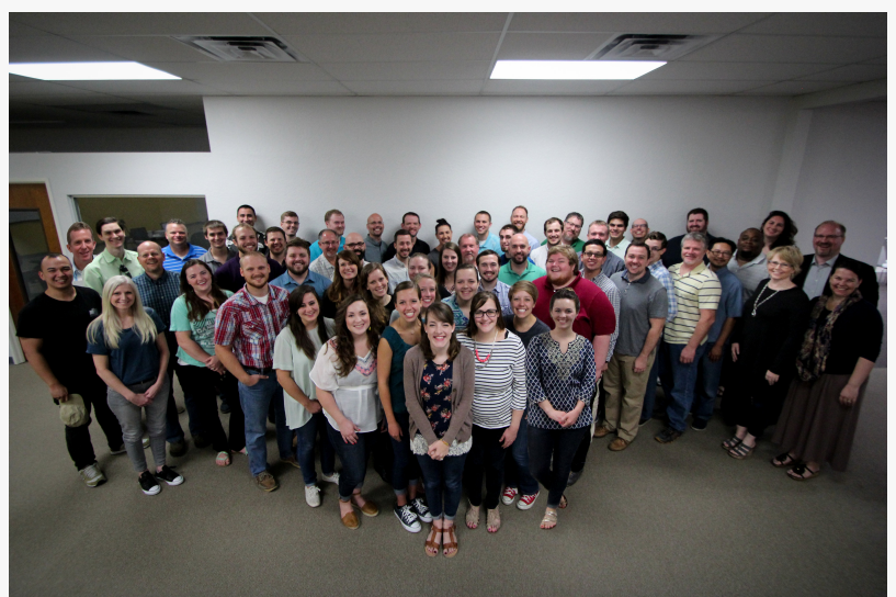
The full team at Qualbe Marketing Group