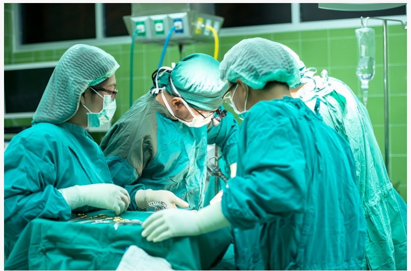
Funding company offers free staffing agency marketing