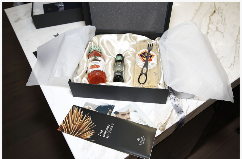
A "make-it-yourself" Authentic Italian Dinner Experience for Six with ingredients produced by IL Palato Italiano.