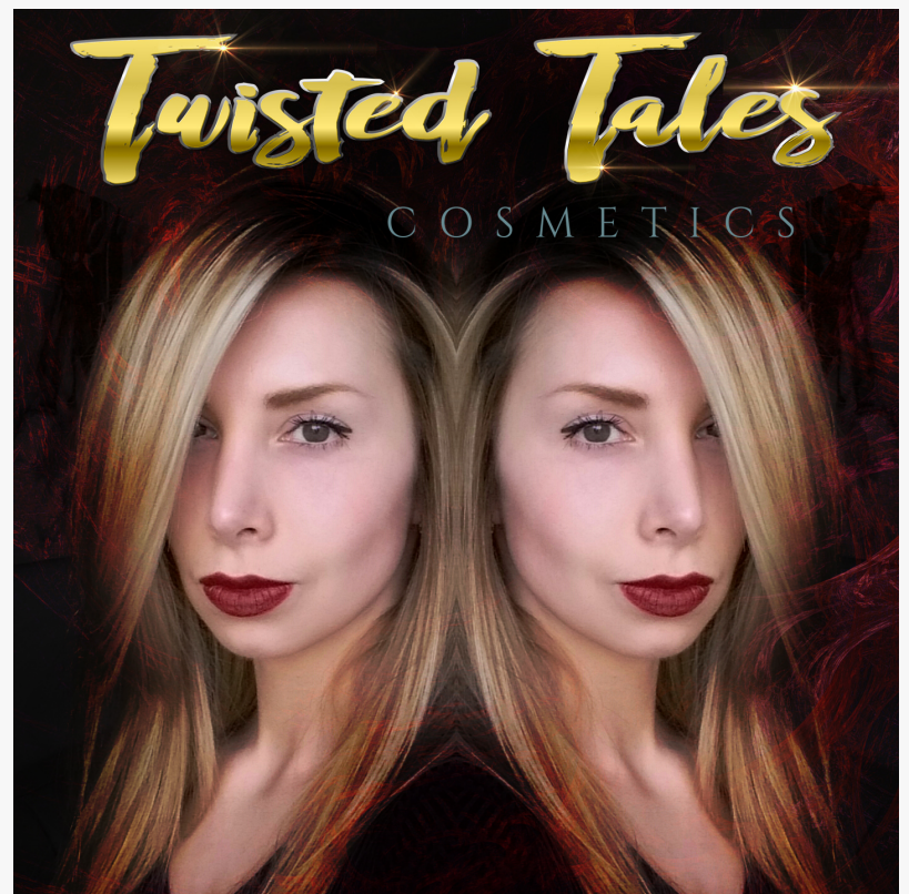
Lipstick shades that embrace women exactly as they are, Twisted Tales and all.