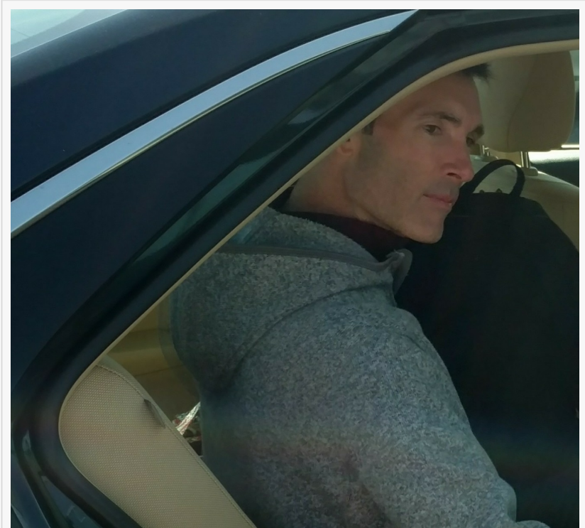
U.S. Credit Czar Depends on Uber for travel around nation

“Sadly, however, because of the experience at National Car Rental last year, I’ve found the car rental