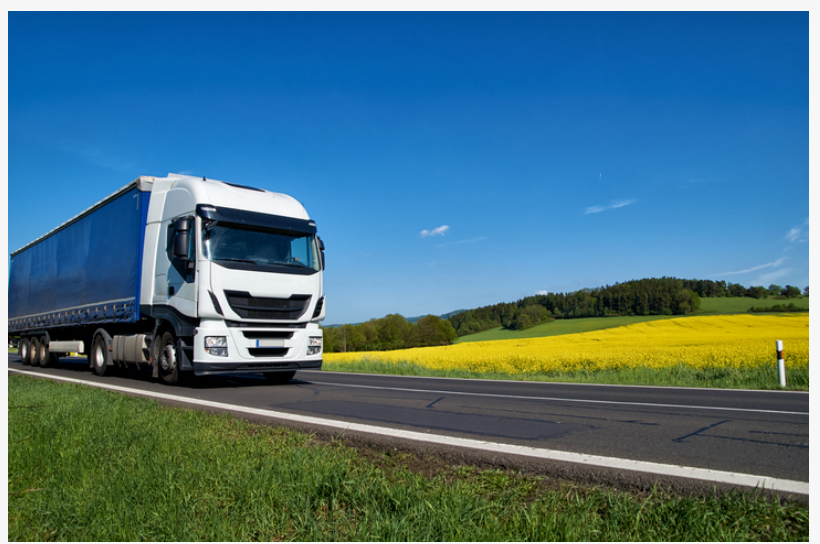
Biodiesel is a clean-burning fuel used for transportation

About Capital Corp Merchant Banking: Capital Corp Merchant Banking offers quality Merchant Banking services for a variety of projects worldwide. Capital Corp Merchant Banking is solution-oriented and known for being the most flexible Funding Source on the Market in creating handcrafted investment structures to meet the needs of the different constituent groups in each individual transaction, including general project funding, equity funding, debt restructuring, and real estate development. For further information, please visit us at www.capitalcorpmerchantbanking.com .