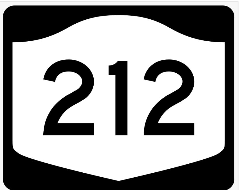
New 212 Phone Number Availability

http://lowerinternetcost.com services is the internet services division of TieTechnology LLC. Through LowerInternetCost.com, the company provides affordable and high-quality real time services for