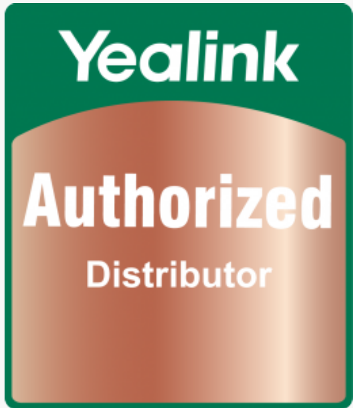
Yealink Authorized Distributor