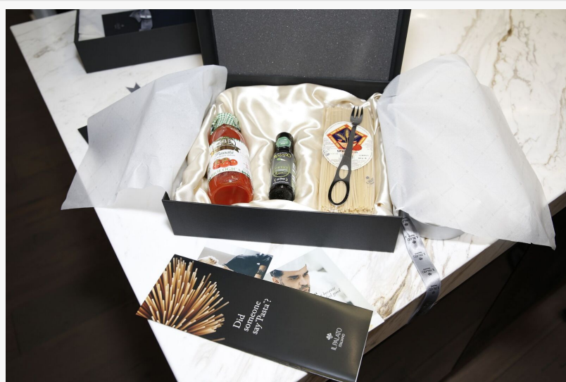
A "make-it-yourself" Authentic Italian Dinner Experience for Six with ingredients produced by IL Palato Italiano.