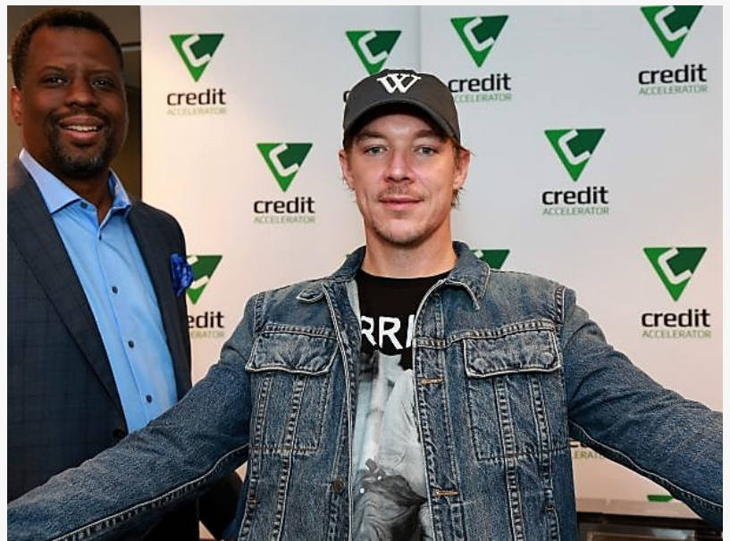
Grammy-Winner Thomas Wesley Pentz, better known as Diplo, is the most sought after music producer. A top credit score is just as important as 892 millions plays of his track "Lean On."