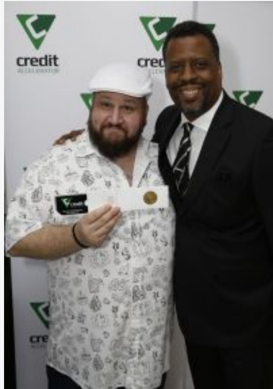
Comic/Actor Stephen Kramer Glickman (Storks) knows a poor credit score is no laughing matter.