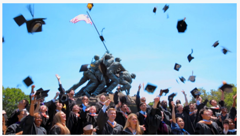
2016 UMT Graduates

From the perspective of affordability, UMT keeps tuition prices low. Over the past twenty years, UMT has never increased its tuition rates. A report by CollegeCalc ( www.collegecalc.org ) in 2017 shows that UMT's tuition is 38% cheaper than the national average for private 4-year colleges and 49% cheaper than the average Virginia tuition for 4-year colleges. Without a large campus, substantial overhead, and expensive fees and housing, UMT keeps its base costs under control. By using technology effectively, UMT is able to operate hyper-efficiently, minimizing the expenses traditional universities face in maintaining large administrative bureaucracies.