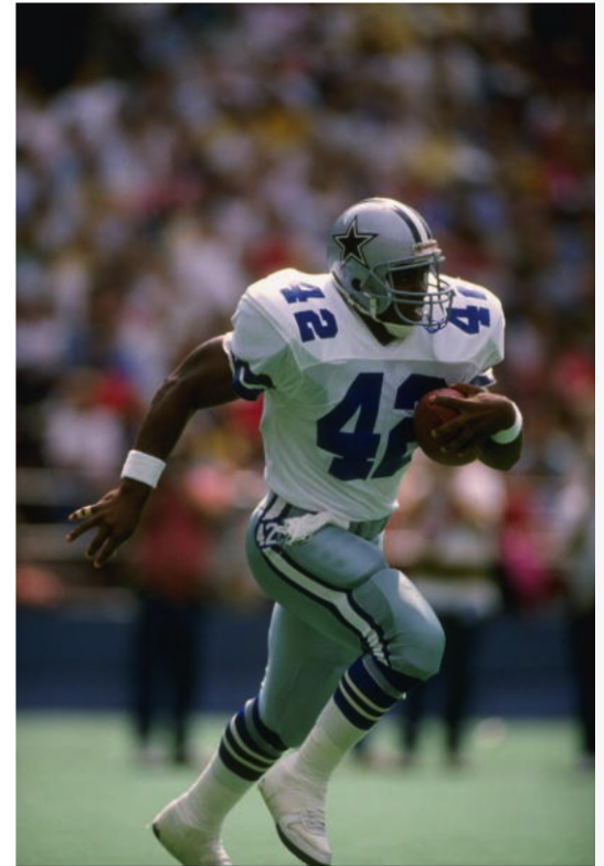
Former Dallas Cowboy, Darryl Clack

Clack decided to team up with Caddell to continue the push after he suffered a stroke in October 2016 brought on by Thrombotic thrombocytopenic purpura (TTP). TTP is a rare blood disorder, under the autoimmune umbrella, where blood clots form in small blood vessels throughout the body. The clots can limit or block the flow of oxygen-rich blood to the body's organs, such as the brain, kidneys,