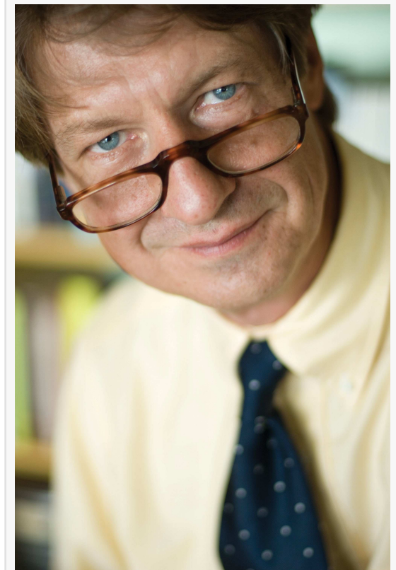
Author and satirist P. J. O'Rourke breaks down the 2016 presidential election in upcoming talk.

Event Details: Tickets can be purchased at livetalksla.org and range from $20-$95. For more information, contact info@livetalksla.org . The talk takes place at the Ann and Jerry Moss Theatre at the New Roads School, 3131 Olympic Blvd, Santa Monica, CA.