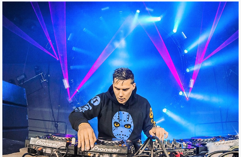
LNY TNZ Jan Stadhouders is a master at translating creativity in new music and bringing a powerful energy to sold-out crowds.