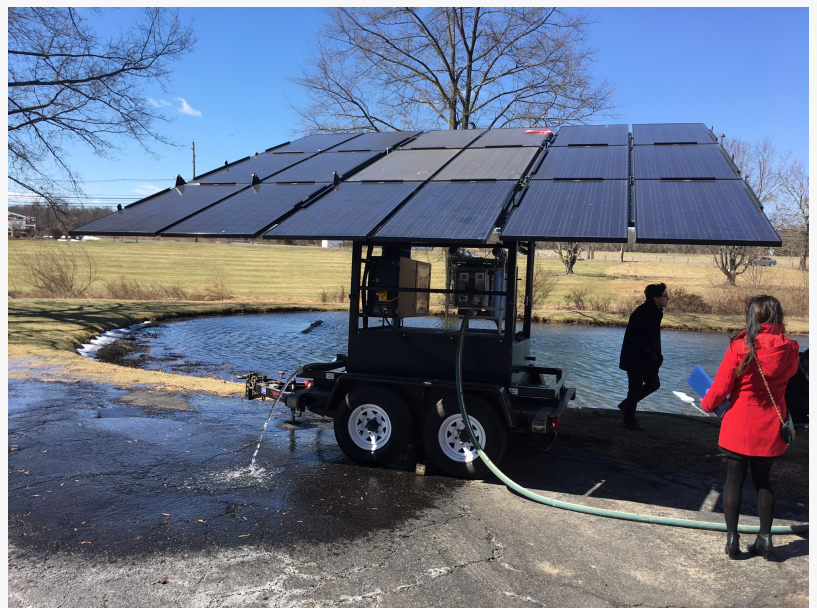
WorldWater's Mobile MaxPure can purify 30,000 gal/day of water from anywhere, with 100% solar power

In 1993, the United Nations General Assembly officially designated March 22nd as World Water Day. Coordinated by UN-Water in collaboration with governments and partners, World Water Day provides a way for organizations worldwide to raise awareness of the global water crisis. Bringing clean drinking water to poor communities and helping the poorest communities develop proper hygiene and sanitation practices are among the issues involved. The U.N. is asking governments to allocate money necessary to give universal access to uncontaminated water and working toilets in or near all homes by 2030. For more information on World Water Day, go to worldwaterday.org .