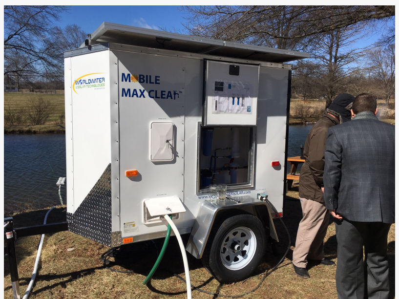
WorldWater announces new solar product - Mobile MaxClear

PRINCETON, NJ, UNITED STATES, March 24, 2017 /EINPresswire.com/ -- On March 22nd, the day that the United Nations designated as World Water Day, a small company in Princeton, NJ provides a solution for a big problem: giving poor people around the globe access to clean water for drinking, hygiene and farming. At their Princeton headquarters, WorldWater & Solar Technologies, Inc. celebrated the 24th annual World Water Day by introducing their newest solar-powered unit, the Mobile MaxClear(TM) that converts water from anywhere into clean, purified drinking water.