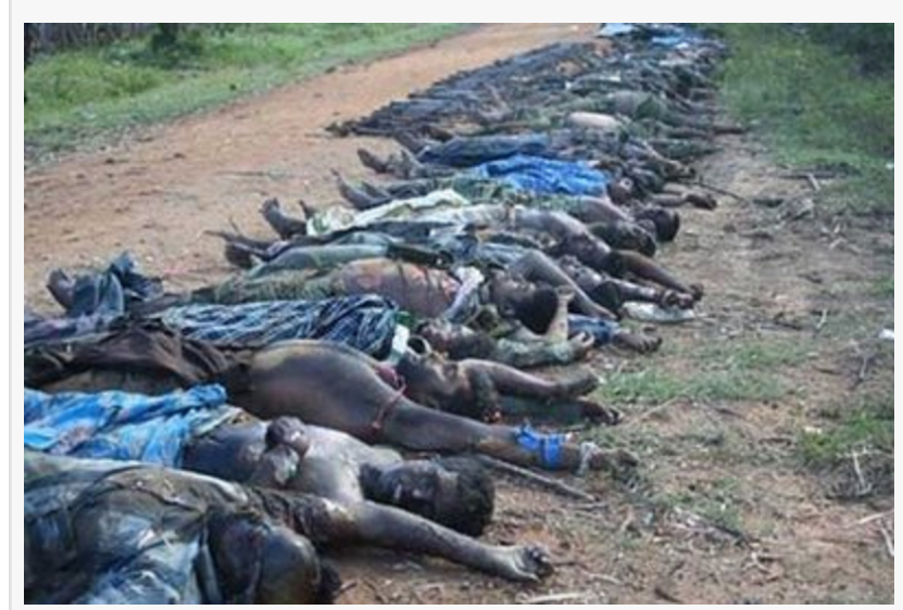
Crimes against Tamils

Tamils for Trump Tamils Need Justice & Freedom