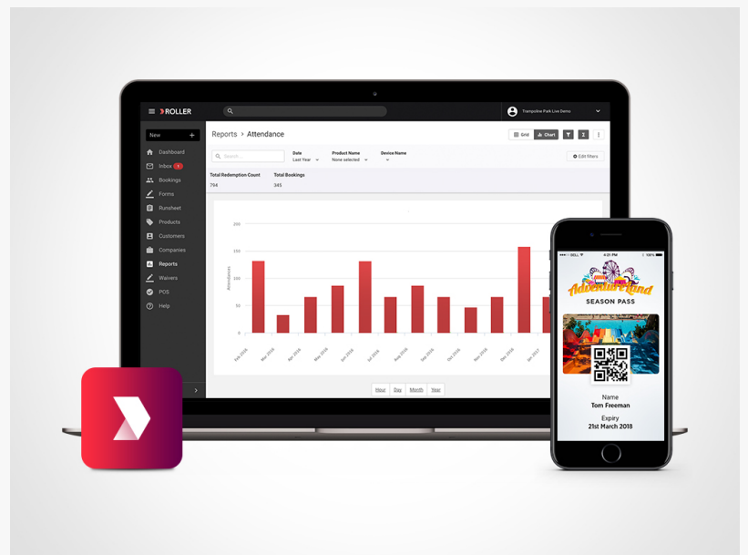
ROLLER Software system