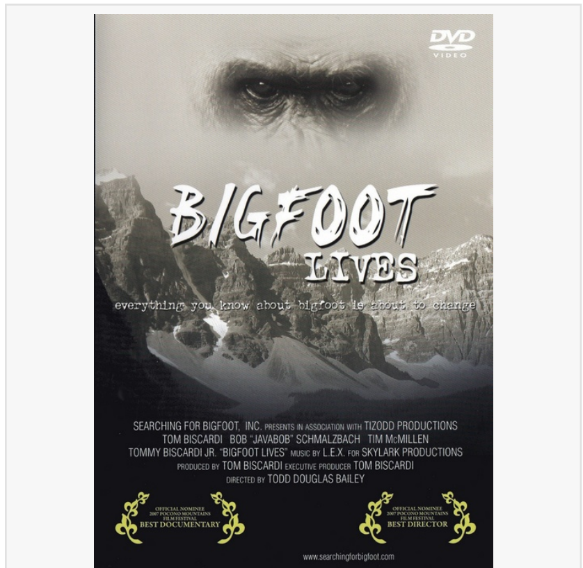
Award Winning documentary film of the hunt.

BGFT is not just for researching the creature; they have a hotel/museum project and a movie project that will promote the legend and raise revenue. The multiple projects sponsored by the company are detailed in the Public Offering on the SEC website as well as on the business website. Be sure to