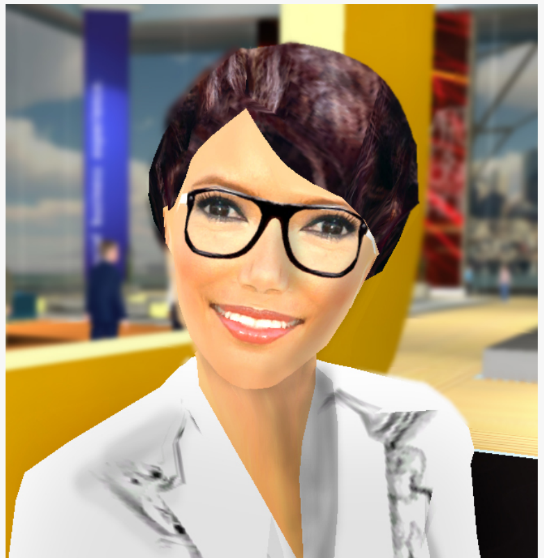
Virtual Booth Assistant Avatar Image

This press release can be viewed online at: http://www.einpresswire.com