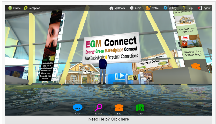
Avatar Contemplating Entrance to EGMConnect 3D Virtual Tradeshow

Ken Riead Doff Industries 816-914-0000 email us here