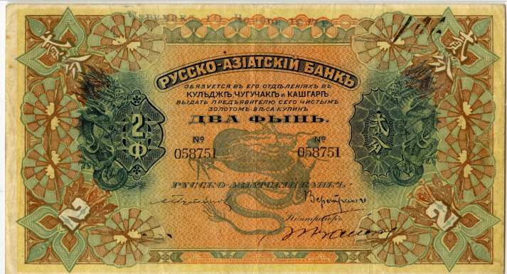
China, issued note, 2 Gold Fen, 1913-1917, P-S480, S/M# O5-51, PMG graded Very Fine 30 with comment "Ink Stamp, Annotation", BWC. Very rare especially this nice.