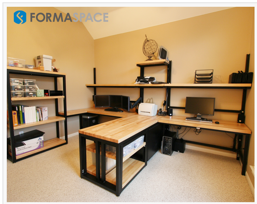
Home Office T Shape Set-Up

According to the Survey of Income and Program Participation (SIPP) and the United States Census Bureau, about 9 percent of us (13.4 million workers out of 142 million) worked at home at least one day a week in 2014. That's up 35% for the decade. And it's the so-called Knowledge Workers in the computer, engineering and science fields that are