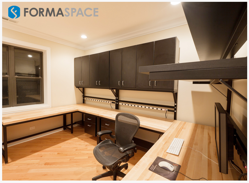
U Shaped Custom Home Office