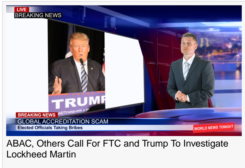
ABAC, Others Call For FTC and Trump To Investigate Lockheed Martin