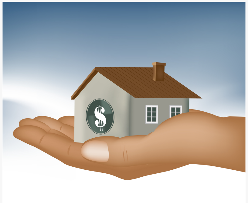
Hand Holding House Image

This press release can be viewed online at: http://www.einpresswire.com