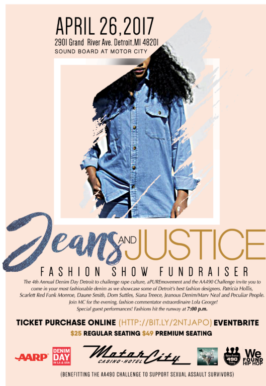
Denim Day Event Flyer, April 26, 2017, Detroit MI