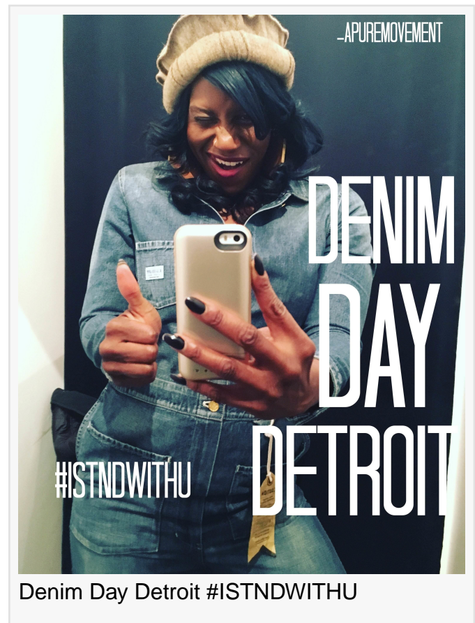
Denim Day Detroit #ISTNDWITHU

https://www.instagram.com/apuremovement/