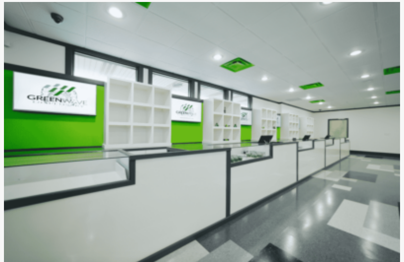
How to design a dispensary

Our expert cannabis dispensary design consultants here at Quantum 9 have collectively created a guide to help companies design a safe and compliant marijuana dispensary . When working with realtors, make sure you have at least 2,500-3,500 square feet within your cannabis dispensary. Your location is important. Pick a facility that is within a popular area with cross streets near the largest intersection in the city. Make sure there is a parking lot for 15+ cars. The ideal location is close to public transportation. It's important that the location satisfies state and federal zoning setbacks for schools, parks, playgrounds, places of worship, or places where children congregate and residences if applicable. Also, make sure your location is American with Disabilities Act compliant, ensure you have a wheelchair ramp and an automated door entry button.