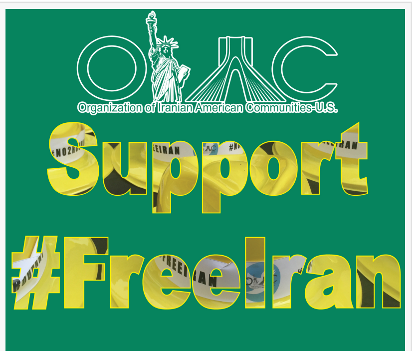
Organization of Iranian American Communities

OIAC-US is the largest, most active, all volunteers, and enduring grass root organization of Iranian-