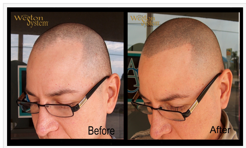
Look Ten Years Younger in One Day

needle specifically for duplicating a hair follicular unit and the specific pigmentation application method to the scalp. Weston filed a patent application for his needle and method in 2009 and the USPTO approved and issued the final patent in July of 2015. Since that time, Weston has turned the hair loss industry on its head.