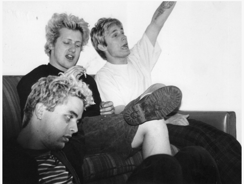
Green Day Getting High

This press release can be viewed online at: http://www.einpresswire.com