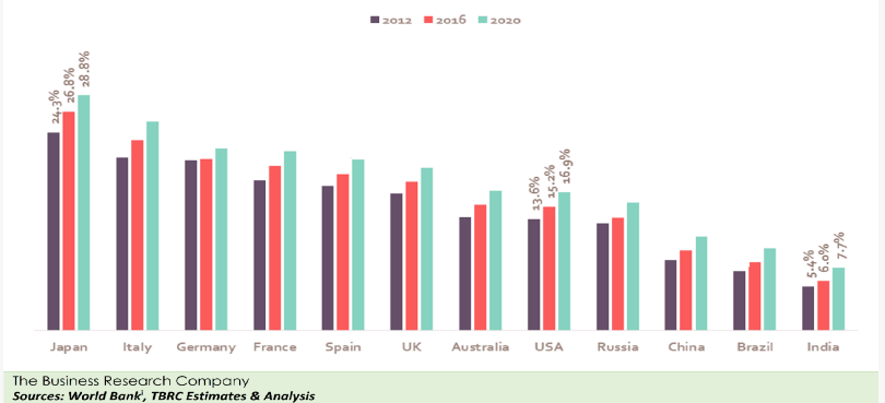
Figure 1: Global Home Healthcare And Residential Nursing Care Services Market, Proportion of Elderly Population (65+) By Country, 2012, 2016 And 2020

http://data.worldbank.org/topic/health#boxes-box-topic_cust_sec