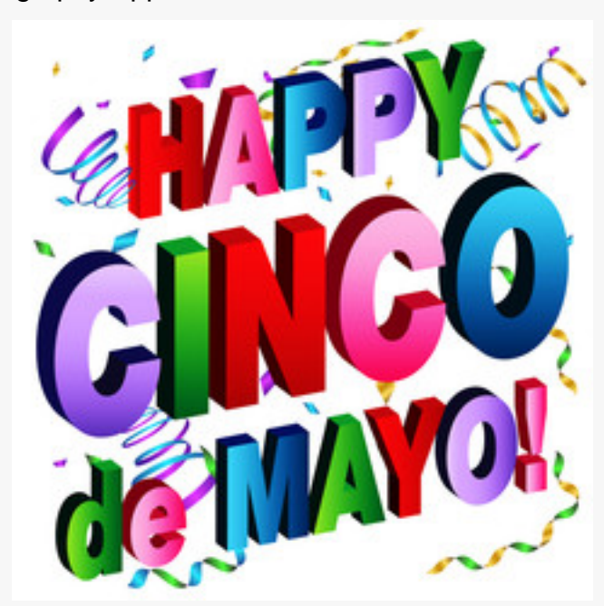
Special Event Apps