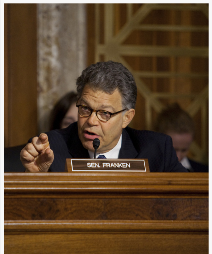
Senator Al Franken (D-MN) appears at Live Talks Los Angeles July 8 to discuss his improbable journey from comedy to politics.