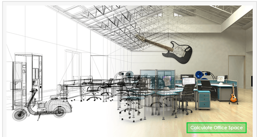
Formaspace Open Office Space Calculator

AUSTIN, TEXAS, USA, May 15, 2017 /EINPresswire.com/ -- Hard charging venture capital funded tech startups and high-growth software companies have helped firmly establish the trend toward open offices. Is an open office design the right approach for you and your employees? What do you need to know to perform proper spacing planning for open office designs? Take advantage of our free online open office space calculator to find out how much space you could save with an open office design concept.