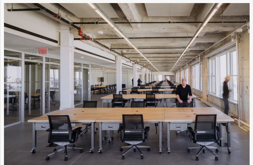
Industrial Open Office