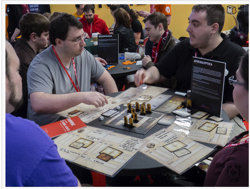
Attendees playing Apochalyptica at PAXEast 2017

The kickstarter campaign for Apochalyptica will be running from May 12th to July 11th, and can be found here: <a href="http://bitly.com/2gabXbi">http://bitly.com/2gabXbi</a>