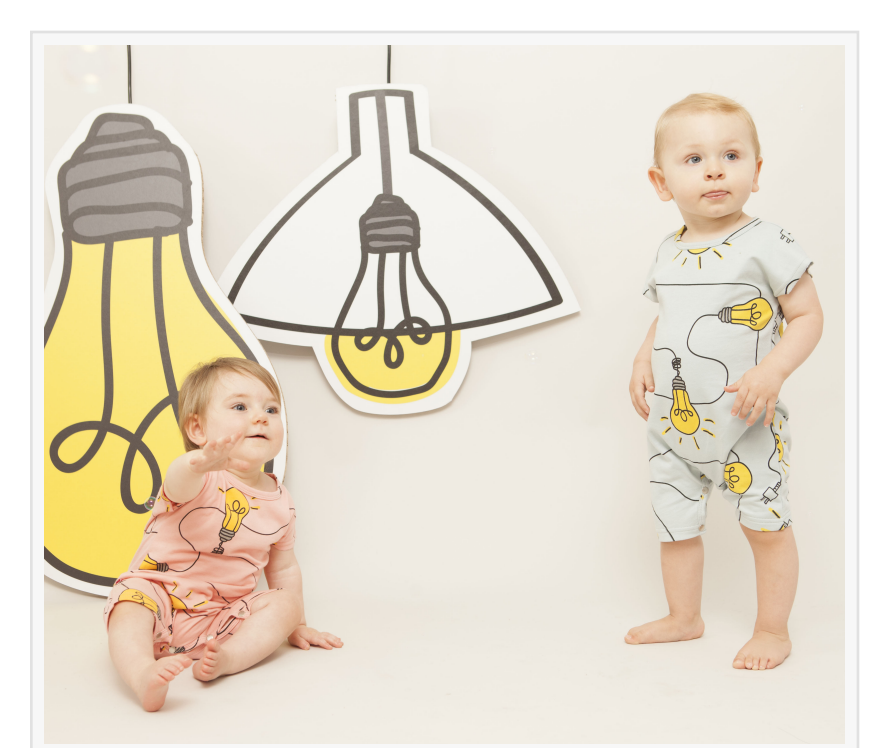
Sooki Baby from Wilshire + Cooper

Press Wilshire + Cooper 3109758484 email us here