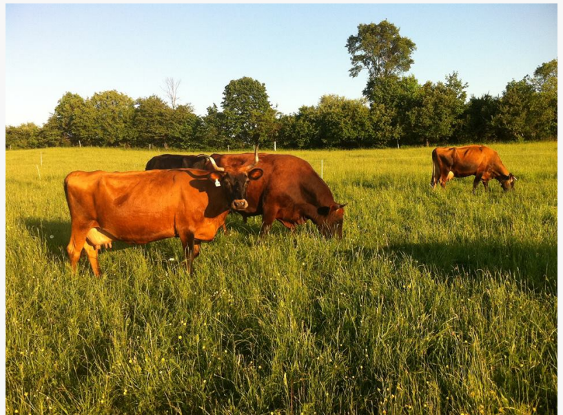
Cows graze at Glencolton Farms as the sun sets

This press release can be viewed online at: http://www.einpresswire.com