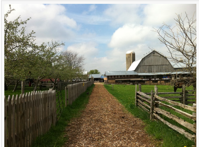
Springtime at Glencolton Farms

Raw milk consumers and advocates claim they prefer the taste, texture and nutritional value of farm fresh milk . Some seek it for therapeutic reasons or because of ethnic food traditions, while others prefer to choose food produced from small-scale dairy farms where farmers raise cows in the sunshine and on green pasture, rather than factory settings.