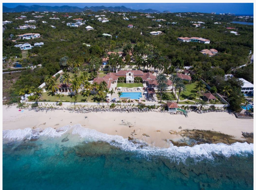
Luxury Villa St Martin

The 11 bedroom property sits on 5 acres which features a main house, guest house and to no surprise a eight foot wall surrounding the property.