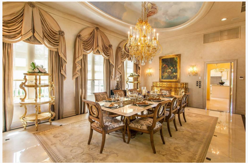
Des Palmiers Beach front villa St Martin

For more information visit http://www.exceptionalvillas.com/ or call + 353 64 66 41170 or toll free from US and Canada 1 800 245 5109 and UK 0845 528 4197