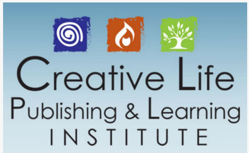
Creative Life Publishing and Learning Institute