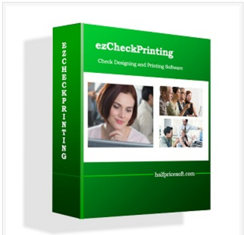
ezCheckPrinting software for all size business