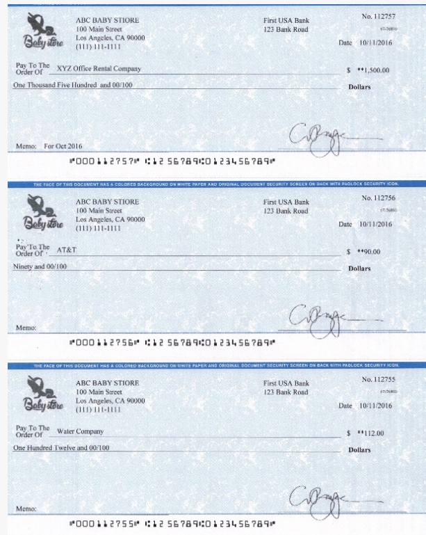
ezCheckPrinting makes check printing an easy job