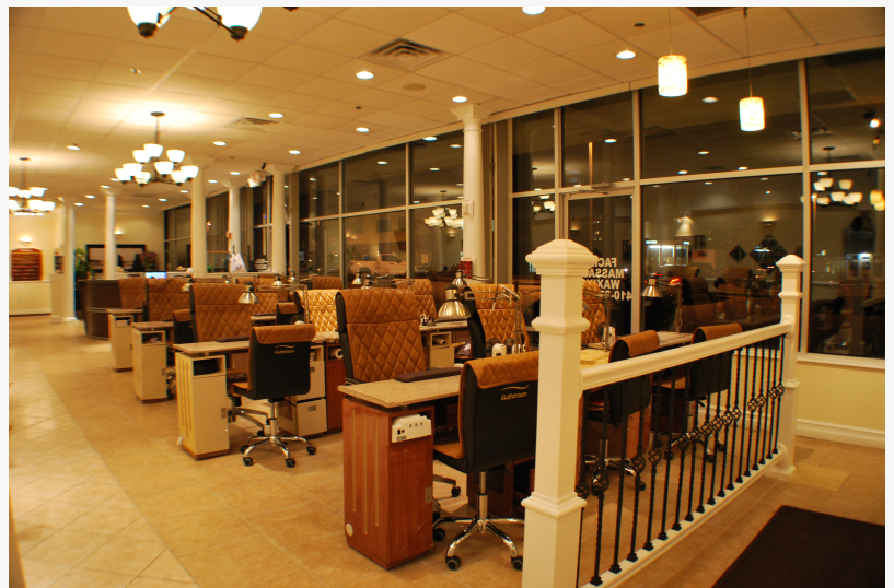
Nail & Hair Care Spa earns second Spectrum Award for Customer Satisfaction

Serving clients well doesn't just come naturally. An emphasis on treating customers with respect is a key aspect of the salon's employee training. “We ensure employees are attentive and are educated on