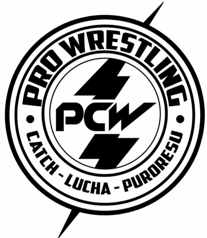
Pacific Coast Wrestling (PCW)