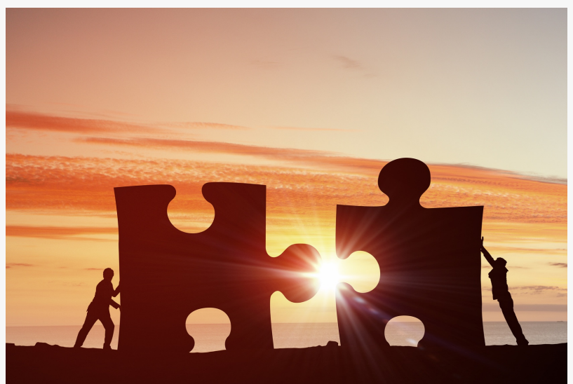
Miami Research Associates

QPSI is a global leader in clinical research. And they are well known for their quality, technical