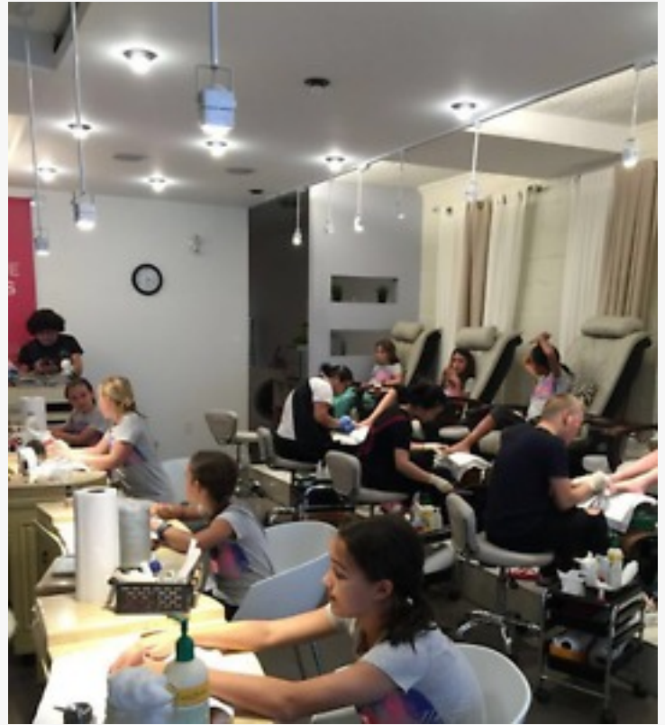
Kassteva Holdings is one of North America's Largest Great Clips Franchise Owners