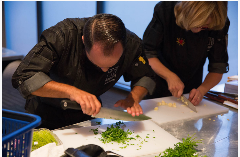
Club Members and Sous Chefs will be paired to compete as teams for two elimination rounds.