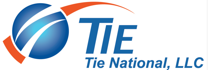
Tie National, LLC