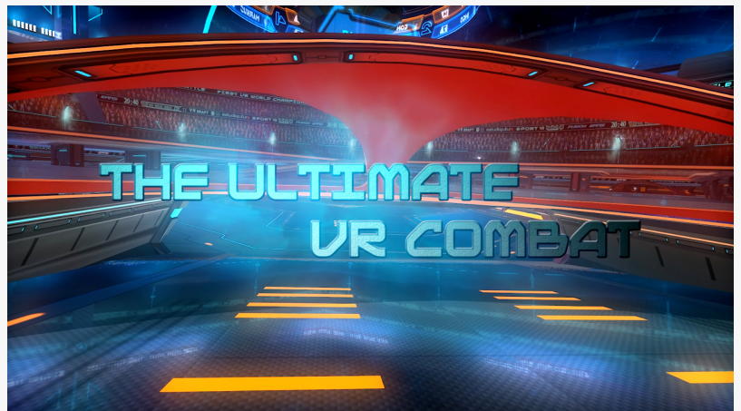
Fusion Wars VR Competitive Arena Screenshot