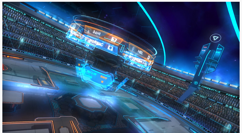
Fusion Wars VR Competitive Arena Screenshot 2