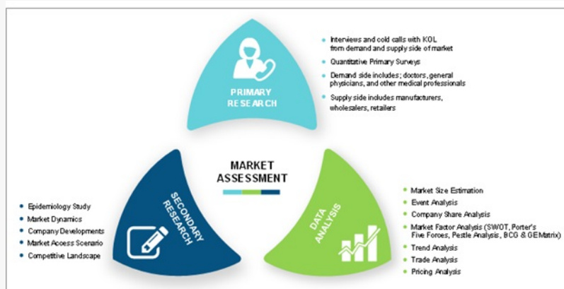
Global Isotretinoin drugs Market- Forecast To 2023

■ Hospitals ■ Research Laboratories ■ Others