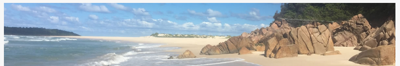
Port Stephens Beaches