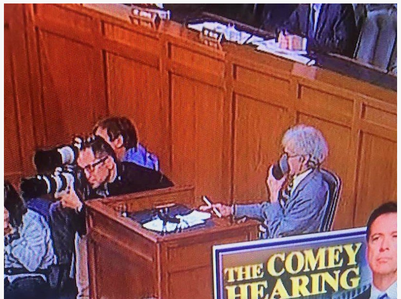
A verbatim court reporter uses a Stenomask to document testimony from James Comey during the Senate Intelligence committee hearing on Trump and the Russia probe.

About Talk Technologies: Talk Technologies Inc. founded in 1947 designs, manufactures and sells Stenomasks to business, industry and institutions around the world. Some of our valued clients include: U.S. Army Inspector General- Pentagon, U.S. Naval Justice Institute, National Guard Counterdrug Task Force, Massachusetts Institute of Technology: MIT, Kennedy Center for the Performing Arts and the NYC Department of Education.