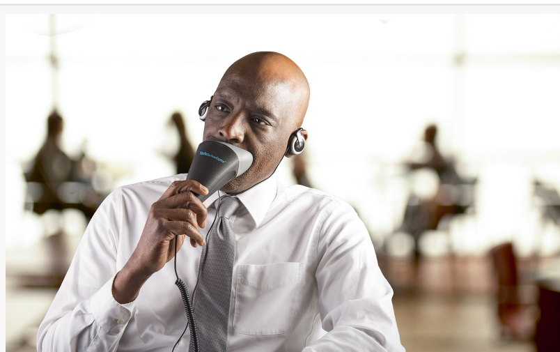
Industry best noise cancelling, speech recognition microphone